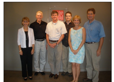
Our friends from Mars Hill Productions. The Producers of the Original HOPE Video

roduced us to a new ministry tool called the Proclaimer . It is basically an audio Bible that can be distributed in primarily illiterate villages. Praise God now everyone can hear the Word!